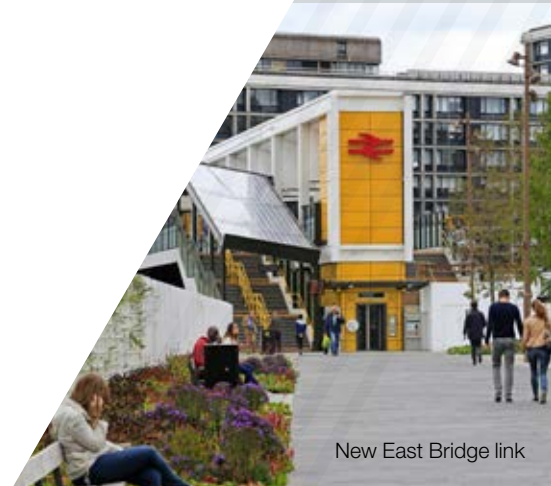
New East Bridge link